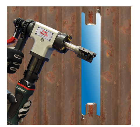
The Tube Weasel is 2.75" wide and can bevel a single tube in a boiler tube waterwall for Dutchman repair.

These innovative design feature are why MILLHOG® Cutter Blades produce precision bevels on tube and pipe without cutting fluids.